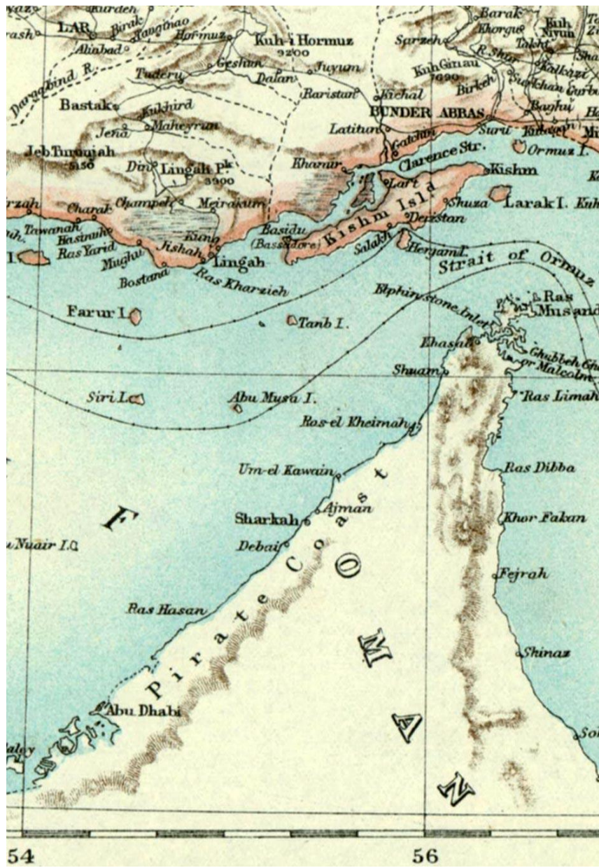
Strait of Hormuz